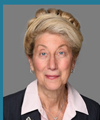
Hon. Shira A. Scheindlin (Ret.) U.S.D.C. S.D.N.Y.