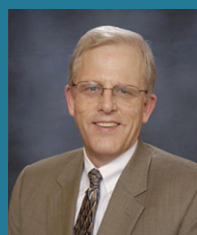
Hon. Craig B. Shaffer U.S.D.C. District of Colorado